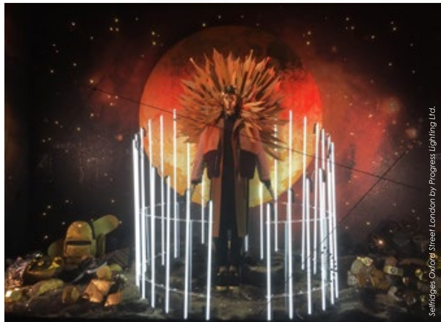
Selfridges Oxford Street London by Progress Lighting Ltd.